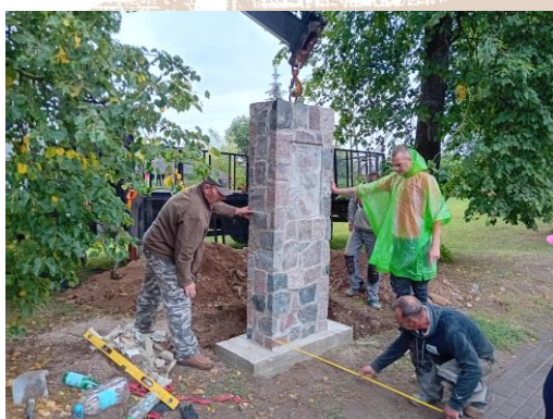
Moving of the stele to the place