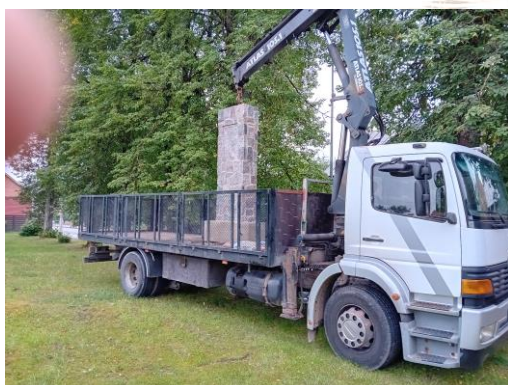
The stele was brought from the workshops

This situation was finally rectified on July 24, 2023. In pouring rain, a memorial stele was erected in the main street of the city, near the Great Synagogue, which had been the centre of Jewish life from 1859 to 1941.